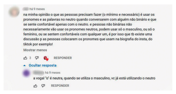
Figure 2 – Reproduction of online comments about pronouns in inclusive language

Although these pieces of evidence and reverberations are a discursive dispute in the speaker's own speech, it is in the online comments that we can visualize it more explicitly. In response to the didactization carried out on the use of pronouns, we reproduced by sampling Figure 02 below.