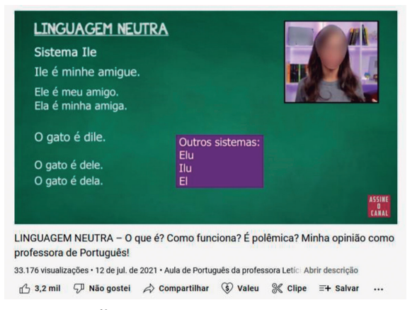
Figure 1 – Image reproduction of video class on inclusive language