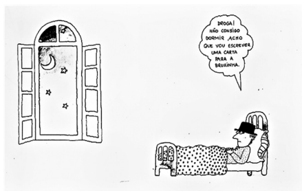
Figure 2 – Text in direct speech in the form of balloon presented to the children

Segment I – S. (8 years and 10 months old)