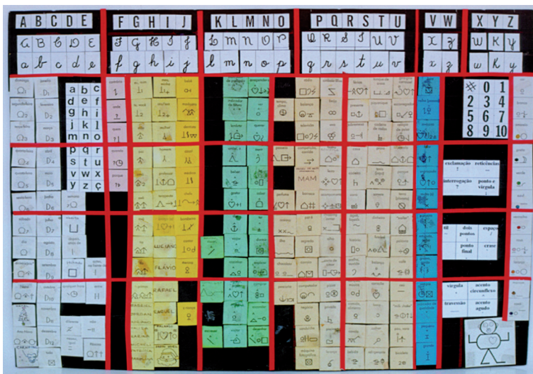
Figure 1 – S.’s communication board with Bliss symbols used in our research

S. used the indirect pointing resource, through looks due to the fluctuation of tone she presented and because of the reflexes that took the place of voluntary movements she tried to perform. In addition, an insistence on pointing with direct indication would result in global motor disorganization which, due to reflex interference, would cause S. to even come out of the seated position, extending herself, what would require new postural stabilization and a resumption of communication all the time. Hence, the option to point through looks was chosen.