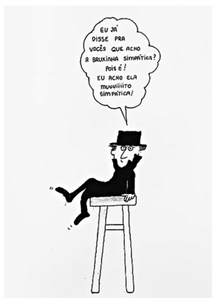
Figure 5 – Segment that contains the word muuuuito (soooo): “I already told you that I think Little Witch is nice? That’s right! I think she is soooo nice!” 49