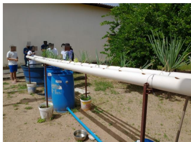
Figure 3 - Aquaponics Project