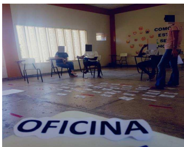
Figure 5 - Workshop on confinement