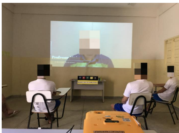
Figure 2 - Recorded class