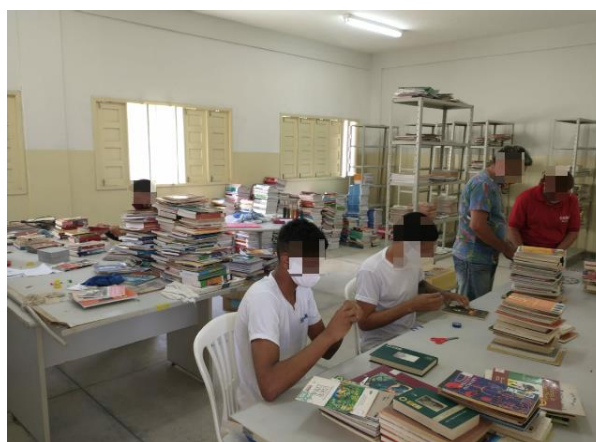
Figure 4 - Cataloguing and organization of books