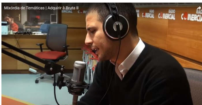
Figure 18 – The continuation of the radio controversy a year later