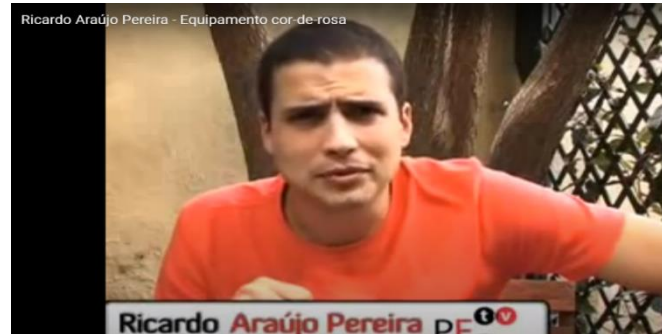
Figure 8 – RAP, “Pink Equipment”

Question: What are the arguments in favor of Benfica's pink kit?