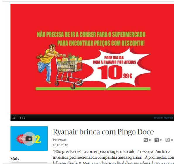
Figure 16 – Advertising campaign repercussions