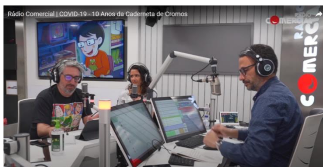
Figure 21 – Nuno Markl, “COVID-19 – 10 Years of the Chromium Book”

Source: Rádio Comercial | COVID-19 - 10 Anos da Caderneta de Cromos (2020)