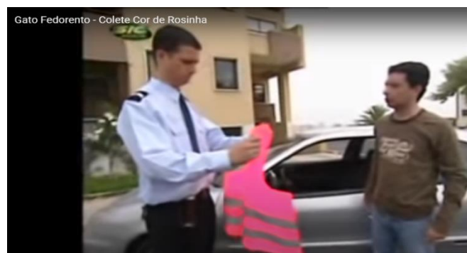
Figure 9 – Gato Fedorento, “Pink Vest”

Question: This sketch was created to alert attention to the introduction of a new law. Which one? (The aim is also to establish a link with video 1)