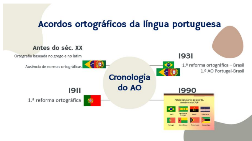
Figure 20 – The orthographic agreement of the Portuguese language

4. Orthographic agreement: students are asked about some aspects of the agreement as an introduction to the subject, from facts and myths to the changes implemented and their application in practice (or not) in different contexts (university, government, media social, etc.).