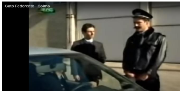
Figure 12 – Gato Fedorento, “Fine”

1. Watch the first part of the sketch (up to 1:26).