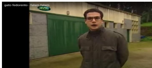
Figure 10 – Gato Fedorento, “The man to whom it seems it happened I don't know what”

Question: Who is the target of criticism of this sketch?