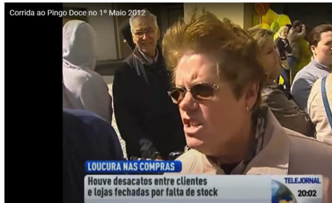
Figure 15 – Consequences of a Portuguese hypermarket campaign on television