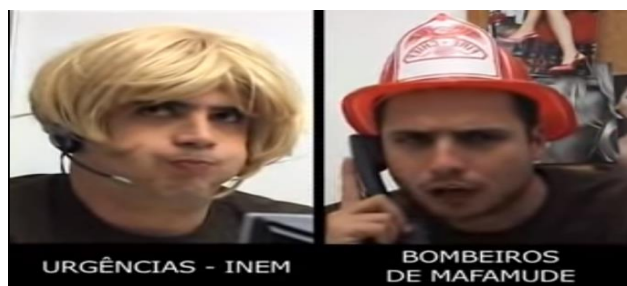
Figure 11 – RAP, “Hotline (INEM - Mafamude Firefighters)”