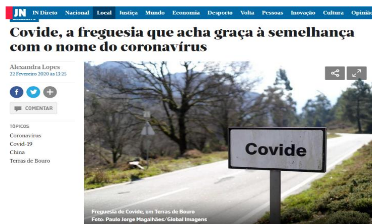
Figure 14 – Unusual Portuguese toponym image