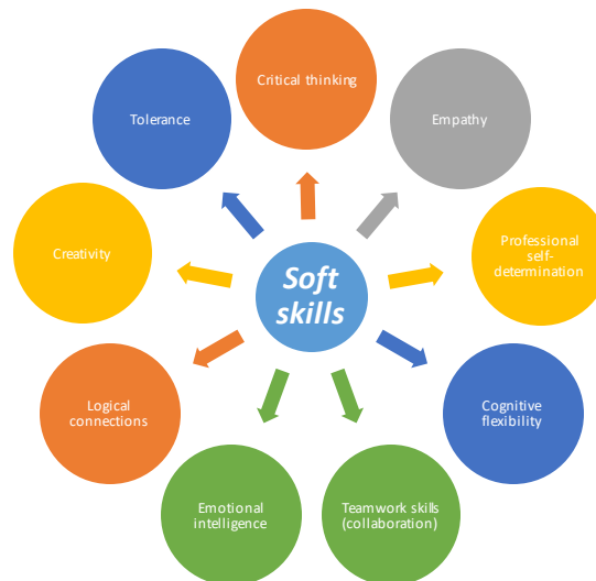
Figure 3 –Key competencies model (Soft skills)

* Experimenting with learning formats, in particular, using various models of blended learning (STAKER; HORN, 2012), primarily the Rotation model, a variation of which is now the well-known Flipped-Classroom model ("inverted classroom").