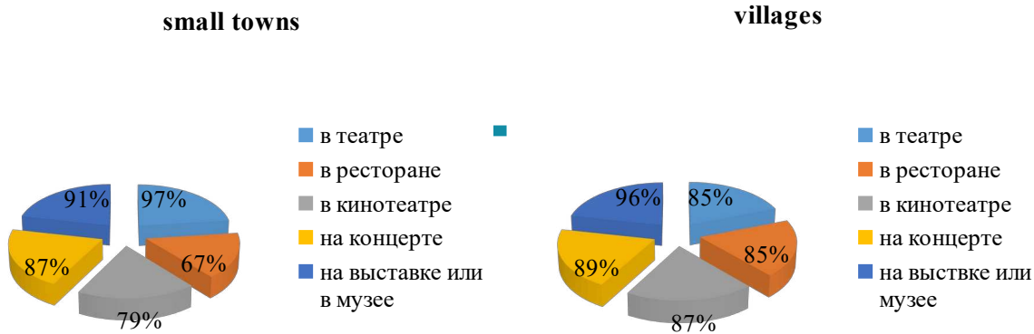
Fig.1. Distribution of answers about visits to leisure facilities (according to FOM surveys)

residents of small towns and villages more often say they have a lot of free time. 60% of residents of small towns and 51% of villagers state that they have a lot of unoccupied time not only on weekends, but also on weekdays. It can be assumed that this is connected with the high level of unemployment: when asked about vacation plans, 43% of residents of small towns and 54% of residents of villages said that they do not have vacations because they do not have permanent jobs. And even those who do have vacations are planning to spend them at home or at the country house: only 16% of town residents and 8% of rural residents are planning to go somewhere else when on vacation. Obviously, this craving for home-stay is also influenced by the phenomenon of seasonal or temporary work: those who works on a rotational or seasonal basis on the side, as a rule, prefers to rest at home (Miroshnichenko et al., 2019). Unfortunately, due to the lack of a developed cultural infrastructure in small towns and villages, opportunities to spend their free time here are severely limited. When asked where they have managed to visit over the past year, the majority of residents of small towns (ST) and villages (V) were forced to admit that they have never been to cultural and leisure institutions during this time (Fig.1).