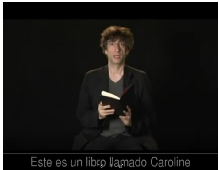
Figure 2: Gaiman reading his own work