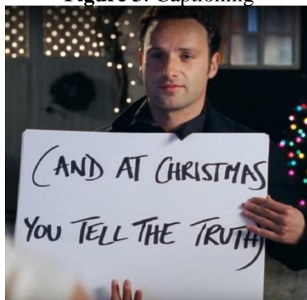
Figure 3: Captioning

They could also improvise a voice-over both repeating the original English voices, which is an excellent way to practice pronunciation and intonation, and interpreting the English source text into their own language with preparation and a few dry runs.