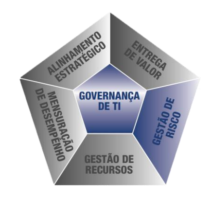
Figure 2 - Areas of focus on I.T. governance

According to the IT Governance Institute - ITGI (2007), IT governance consists of leadership aspects, structure and processes, so that the Information Technology area supports and improves the organizational goals and strategies. Besides these characteristics, it integrates and institutionalizes good practices, enabling organizations to better use their information assets, maximizing benefits, capitalizing on opportunities and gaining competitive advantage. Figure 2 illustrates the areas of focus that contributes to the transparency of I.T. costs, value and risks, according to the Control Objectives for Information and Related Technology (COBIT) model, version 4.1.