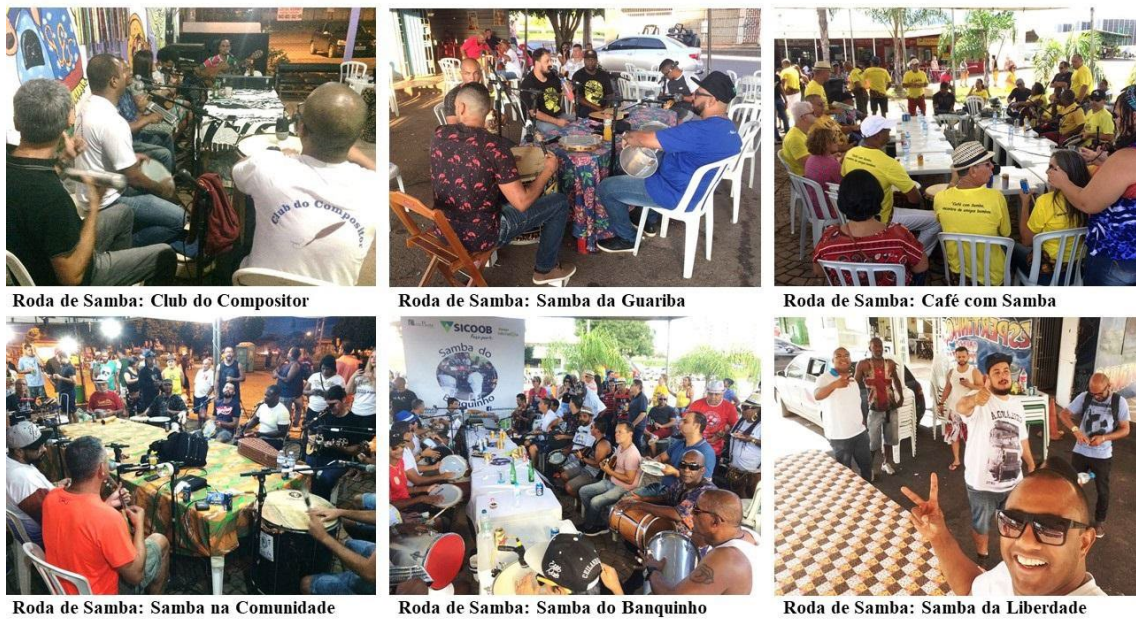
Figure 3 – Records of existing samba circles in the Brazilian Federal District

establishment (when in show houses and some "elitist" bars), "couvert artístico" fees are also charged to the musicians and groups that perform. However, one must consider that even in this set of social processes (of production, circulation and consumption), present in the commercial samba circles, there is still the possibility of exchange relations that are not commercialized (ALVES, 2019).