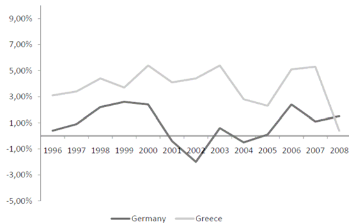
Chart 3 - Different trajectories of domestic demand in ‘center’ and ‘periphery:’ % change of real domestic demand